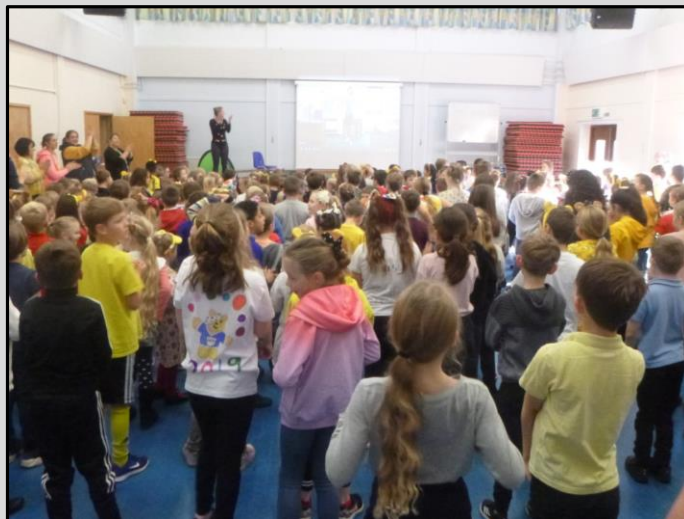
Children in Need T-Shirt Winners